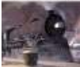
THE POLAR EXPRESS